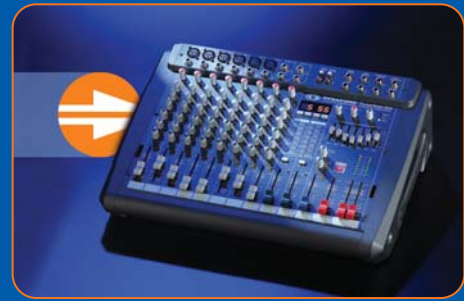
6 MIC/LINE + 2 STEREO LINE PowerMate600-2 230V #112959

* Mixing desk in rated condition, Unity Gain (MIC Gain 20 dB), all faders position 0 dB, all pots in mid position, Master fader + 6dB, amplifier rated output power into 8 ohms, Dual channel, unless otherwise specified.