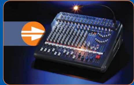
6 MIC/LINE+ 4 MIC/STEREO LINE PowerMate 1000-2 230 V #112926

* Mixing desk in rated condition, Unity Gain (MIC Gain 20 dB), all faders position 0 dB, all pots in mid position, Master fader + 6dB, amplifier rated output power into 8 ohms, Dual channel, unless otherwise specified.