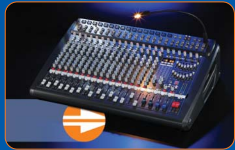
12 MIC/LINE+ 4 MIC/STEREO LINE PowerMate 1600-2 230 V #112960